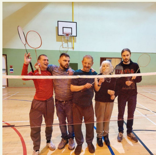
A group from Inspire...By Stonehaven enjoyed a game of Badminton recently.